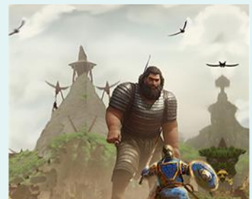
Kordan versus Ohmthus

To contact the author, email editor@RebelBooksPress.com