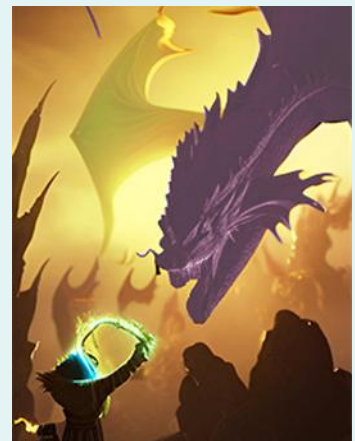
Kordan versus Stelth