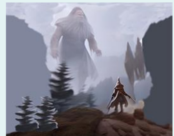
Kordan versus Ningthus